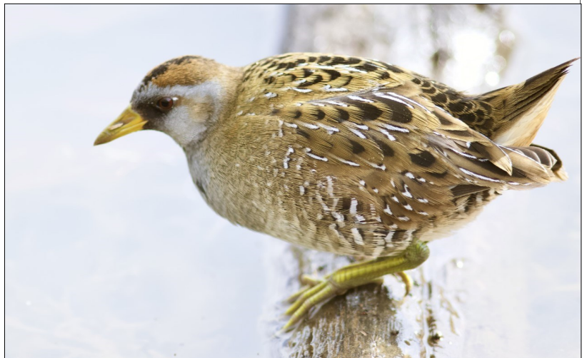
Sora foraging in Huntley Meadows wetland, February 2021.

Quality wildlife viewing at HMP also depends on visitors talking at normal volumes, refraining from using amplified sound, and not riding scooters, hover boards, or bikes on trails where prohibited. On the boardwalk, we ask that visitors avoid running or making other movements that would cause the water to vibrate and pose a perceived threat to animal safety. Pets can provide another potential threat to wildlife both real and perceived, so pets are not permitted on the Heron Trail (boardwalk trail) or the Restoration Trail (gravel trail on South Kings Highway side of Park).