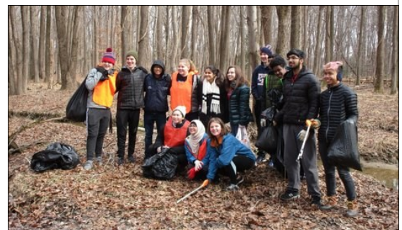
Student volunteers gather following an HMP stream trash pickup, spring 2019.

See you soon, perhaps while volunteering!